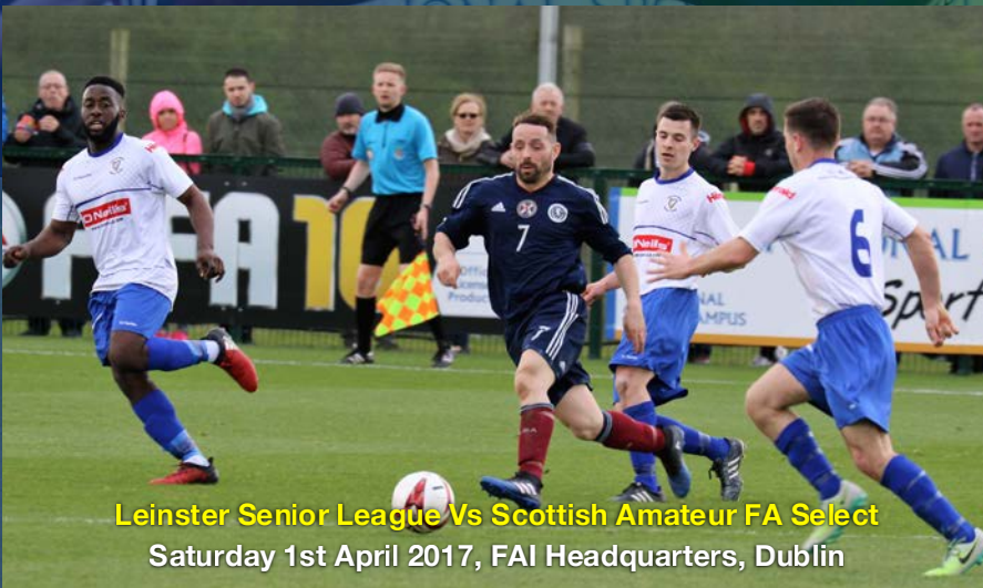
Leinster Senior League Vs Scottish Amateur FA Select Saturday 1st April 2017, FAI Headquarters, Dublin