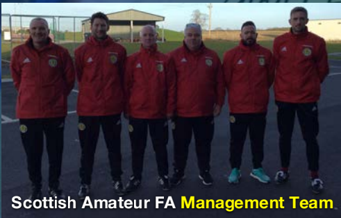
Scottish Amateur FA Management Team