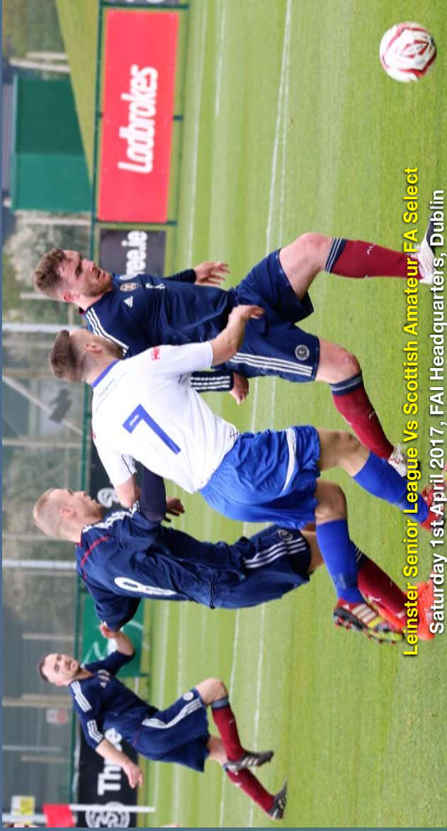
Leinster Senior League Vs Scottish Amateur FA Select

Saturday 1st April 2017, FAI Headquarters, Dublin