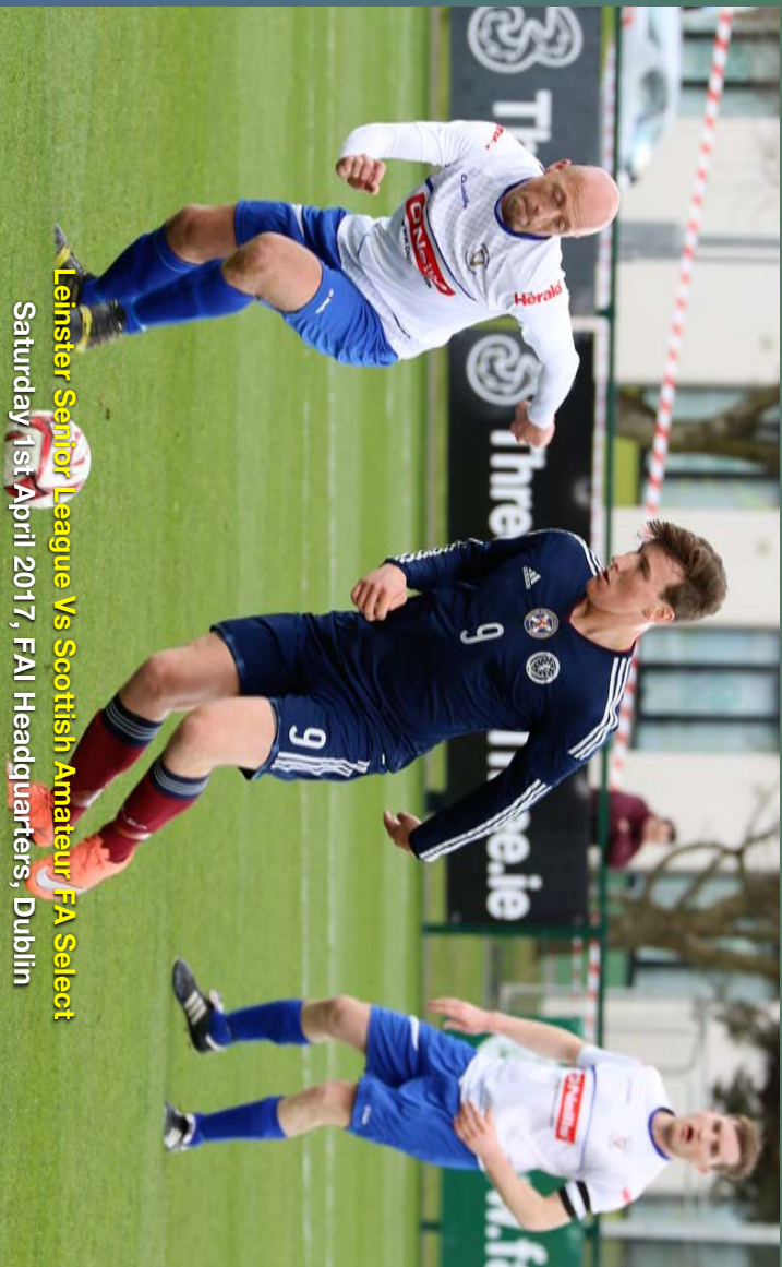
Leinster Senior League Vs Scottish Amateur FA Select Saturday 1st April 2017, FAI Headquarters, Dublin